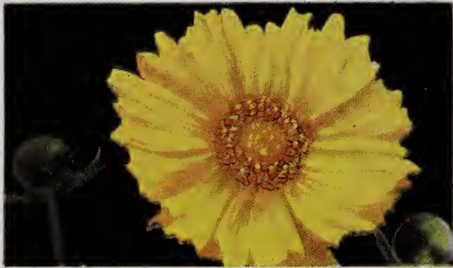
Coreopsis. 20 cts. each